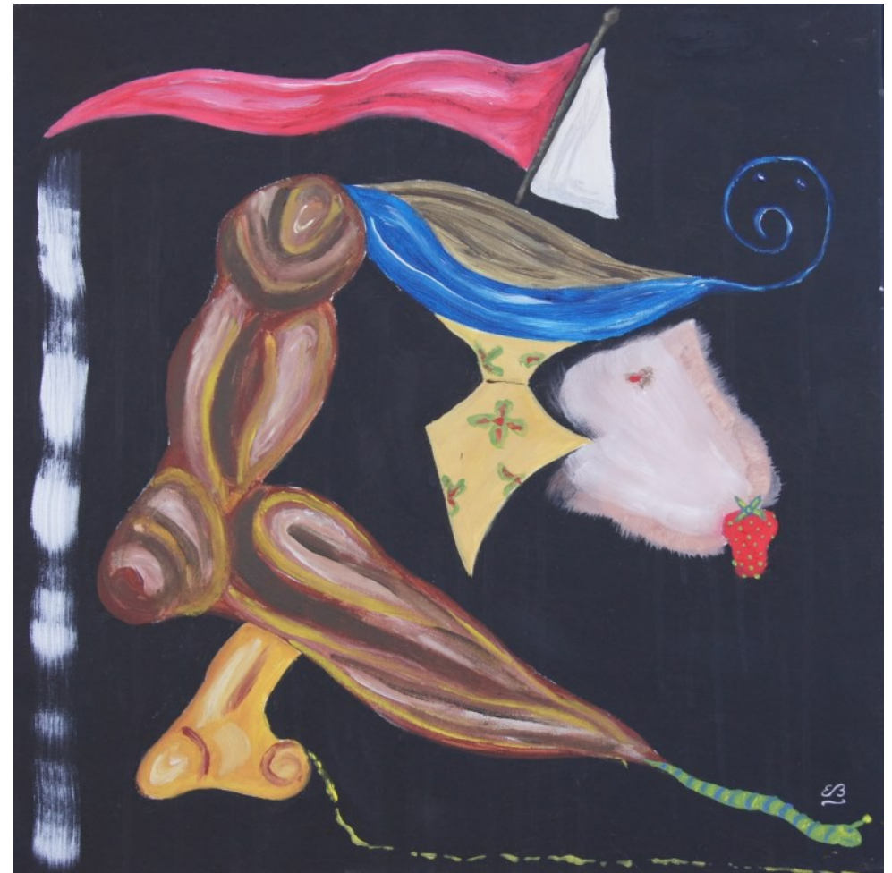
"Like a rolling worm" 50 x 50 cm.