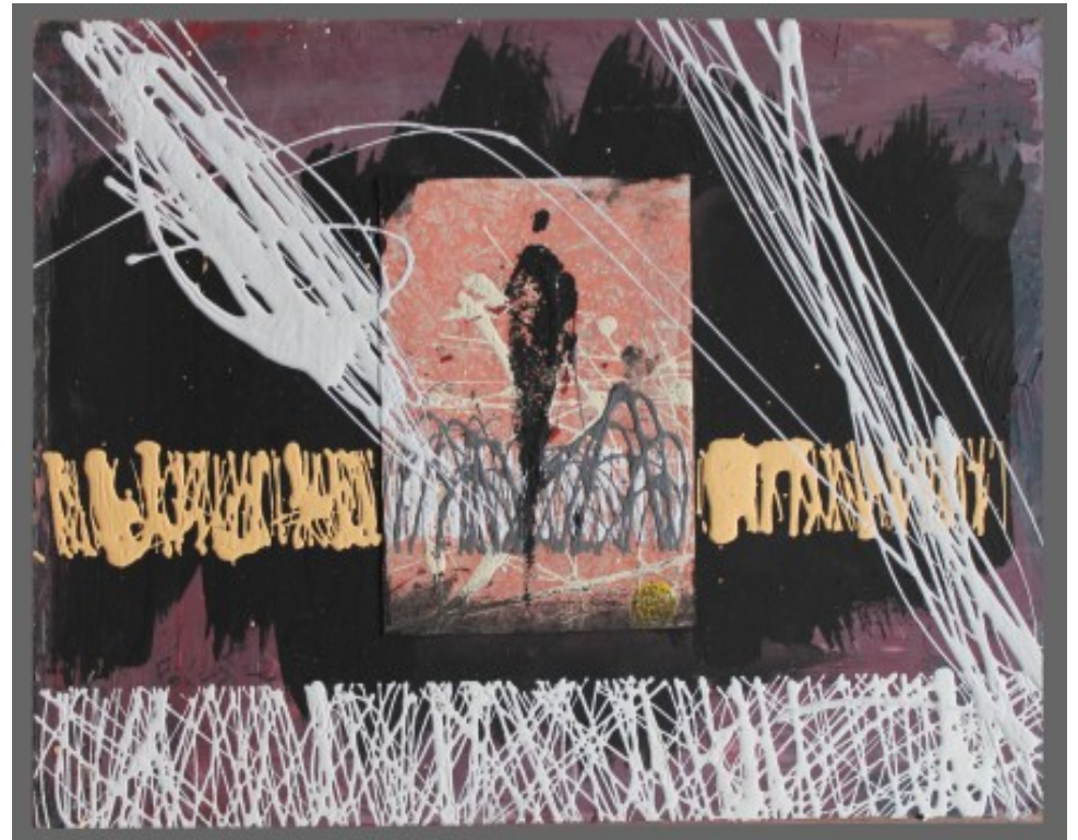
"Status" 30 x 40 cm.